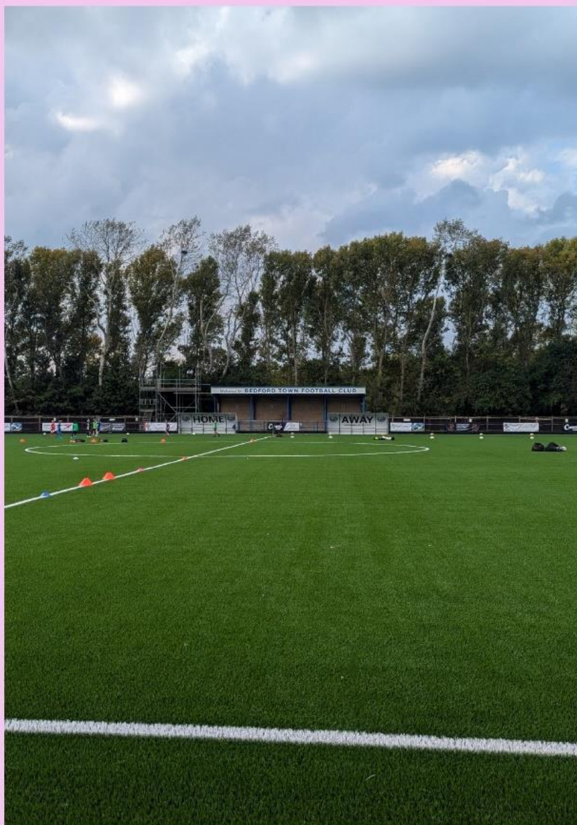
PITCH PERFECT | Two wins from two on the new surface

“The 3G surface will allow all of our affiliated teams to have somewhere to call home, it will bring them even closer to the club and the benefits will be massive. That’s why the club has made this investment; it extends our reach into the local community and it’s the correct way to go about things to give us a sustainable and exciting future.